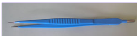
320-132-10 Dissecting forceps—monopolar