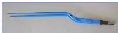
310-200-10 bipolar forceps—Bayonet