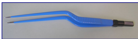
310-180-10 bipolar forceps—Bayonet