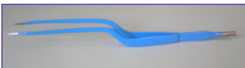
320-152-10 Adson forceps - bayonet - monopolar