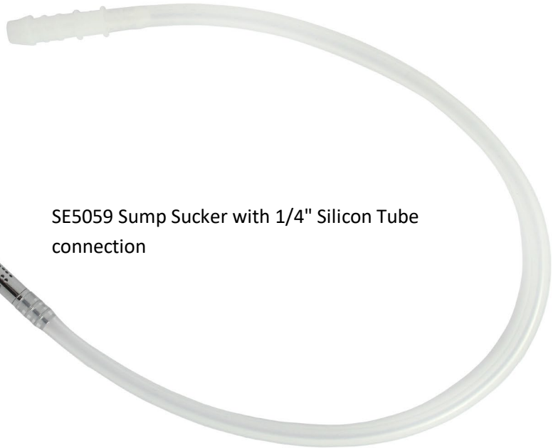
SE5059 Sump Sucker with 1/4" Silicon Tube connection

RB Medical can offer a range of disposable Vascular and Cardiac ends which are compatible with our disposable suction tubes.