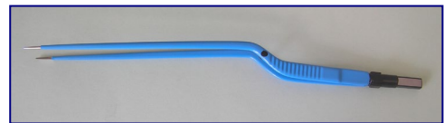
310-200-10 bipolar forceps—Bayonet