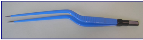
310-180-10 bipolar forceps—Bayonet