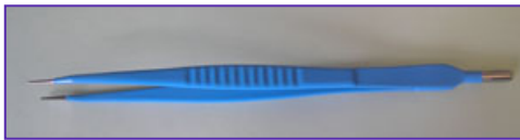
320-132-10 Dissecting forceps— monopolar