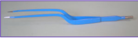
320-152-10 Adson forceps - bayonet - monopolar